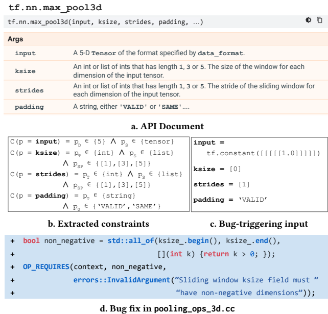
Figure 1: TensorFlow document helps our tool detect a bug that was fixed after we reported it to TensorFlow developers.

the API function. To test as_strided 's core functionality, a testing technique needs to generate a tensor object for the input parameter.